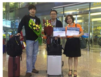
First passengers got welcome flowers from ITS staff