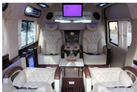
Inside of luxury transfer car

Being Tour Operator specialized on tailor-made and luxury tours in Vietnam and Indochina, ITS promises provide the best care and professional to each of your clients when they travel to the destination